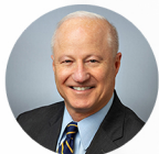
MIKE COFFMAN AURORA